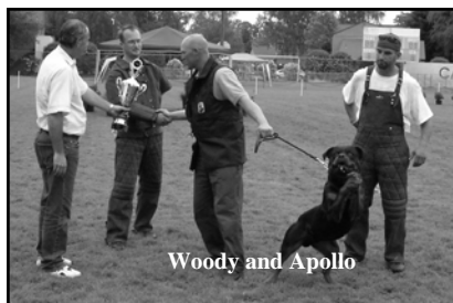
Woody and Apollo

*different elements will be practiced according to the level of each dog that is entered for the seminar at the Seminar Host's discretion